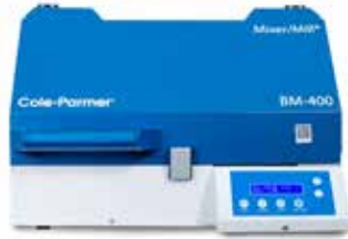
BM-400 High-Energy Ball Mill