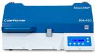
BM-450 Dual High-Energy Ball Mill